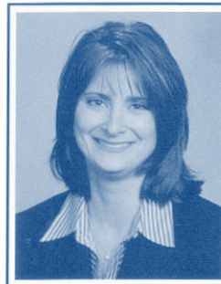
Owned And Operated By NRT LLC.

118 West Orange Street, Altamonte Springs, FL 32714